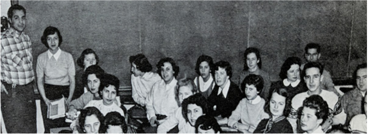
Early students 1940s