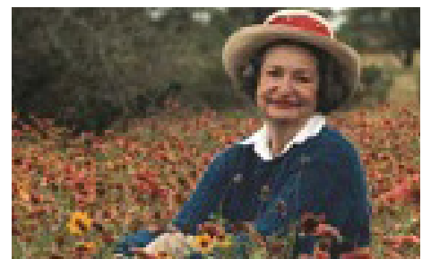
Lady Bird Johnson dedicates the garden named for her by The Native Plant Center on Oct 8, 1999.