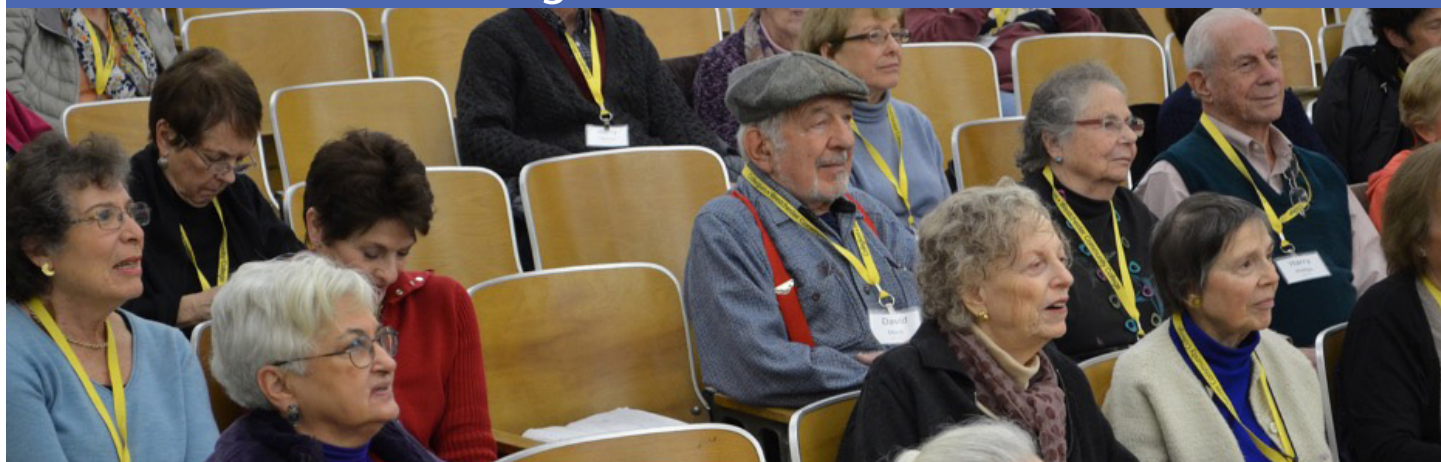
Collegium members attending a lecture

A small classroom building near the south end of the campus is home to one of Westchester Community College's best kept secrets: The Collegium for Lifelong Learning. The Collegium is a member organization that is sanctioned by the College to serve senior learners. Since 2004, Collegium has been offering 4-6 week courses in the arts, history, science, religion, and current events to a grateful community of retirees and other lifelong learners. Courses are offered