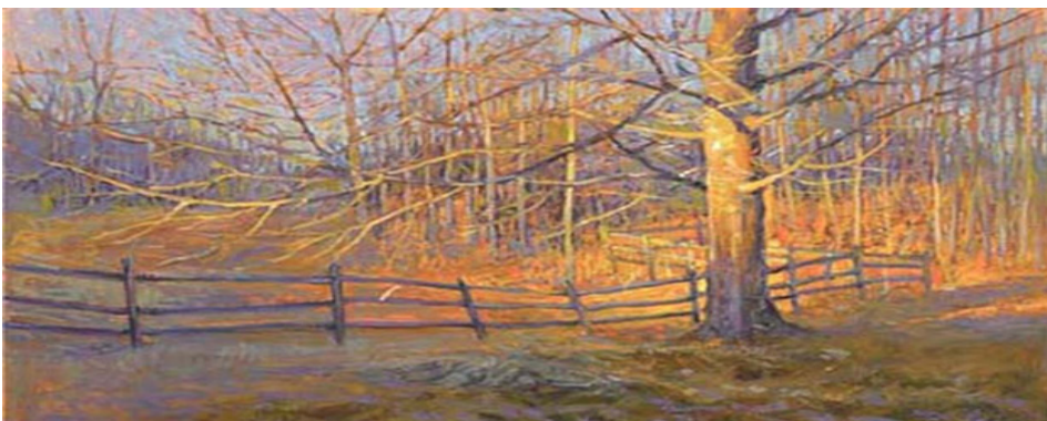
Joseph Fama, Class of 1975 Sunset (Oil) On view at “Celebrating 75: Art and Design Alumni” Sept 1 – Dec 10 WCC Art Gallery web site